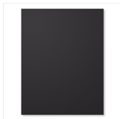
Basic Black 8-1/2" X 11" Cardstock - 121045