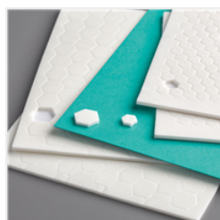
Mini Stampin' Dimensionals - 144108