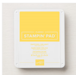
Daffodil Delight Classic Stampin' Pad - 147094