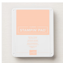
Petal Pink Classic Stampin' Pad - 147108