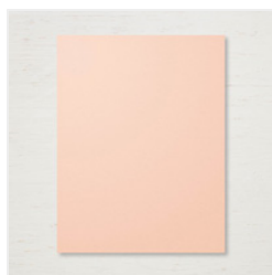
Petal Pink 8-1/2" X 11" Cardstock - 146985