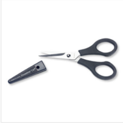
Paper Snips - 103579