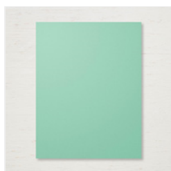
Coastal Cabana 8-1/2" X 11" Cardstock - 131297