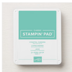
Coastal Cabana Classic Stampin' Pad - 147097