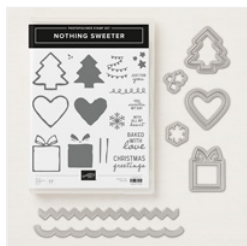
Nothing Sweeter Photopolymer Bundle - 149955